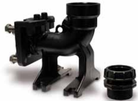
All product images are indicative only